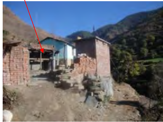
A far view from SW direction of the proposed site.

The proposed site is situated on a colluvial terrace in centre of the Village Diyadi. The overburden thickness in the proposed site is about 15-20m approximately. There are fragments of phyllite and siltstone in the overburden material of approximately 5-10cm in