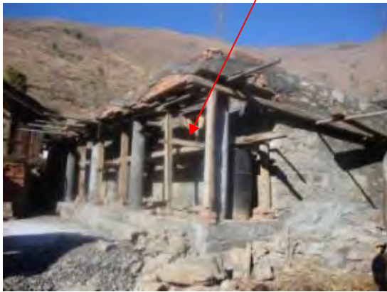
A side view from South direction of the proposed site.

Construction already started at the proposed site