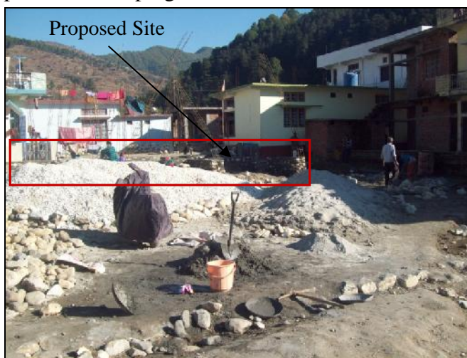
Close views of the proposed site

The proposed site is on river born material varying in thickness range from >30m approx. The site is in town area and thus is a flat land urban area. The hill slope is about 250-300m having slope 35 o -40 o sloping in NW direction.