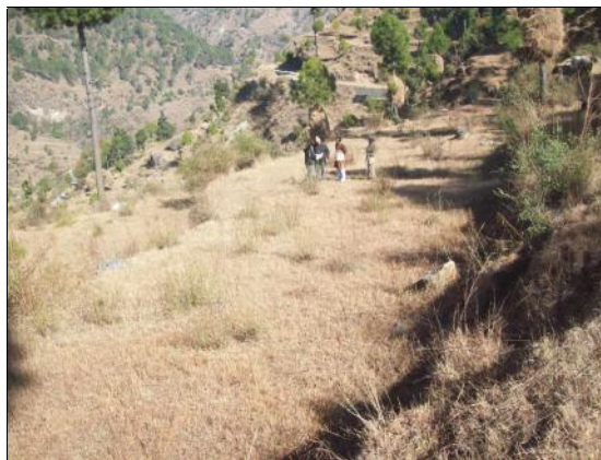
Far view of the proposed site

The proposed site is on colluvial overburden material varying in size range from 02-04m. Man-made cultivated terraces are present with boulders of varying size intact in the soil at and around the proposed site. The uphill slope at the proposed site is 45°-48° and the downhill slope is 25°-27° approx sloping in N 345° direction. The proposed site is on the left bank of 'Varnigad', a tributary of Yamuna river, flowing almost 200-300m vertical distance from the proposed site in N 270° direction. Around the proposed site location, moderate mix vegetation is present at about 70-80m approx.