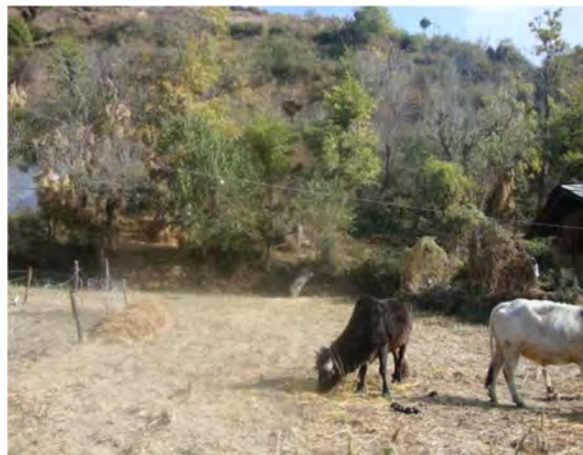
A far view of the proposed site from West direction.

The proposed area is on a flat colluvial deposit man made terrace. The soil type here is colluvial and brown colored silty clay material with thickness of 1-2m. The general slope of the site is 15^{\circ} - 20^{\circ} towards West direction. The proposed site depending on the geotechnical observations is stable for the construction of the house.