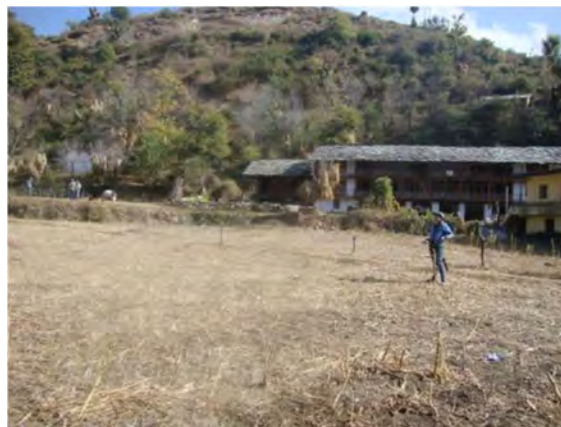
A side view of the proposed site from West direction.

The proposed area is on a flat alluvial deposit man made terrace. The general slope of the site is 5^{\circ} - 10^{\circ} towards Southwest direction. The soil here is brown colored silty clay material with thickness of 2-4m. The Nagangaon-Masalgaon motor road and some houses in the NE direction have been constructed within the past 5 years. The proposed site depending on the geotechnical observations is stable for the construction of the house.