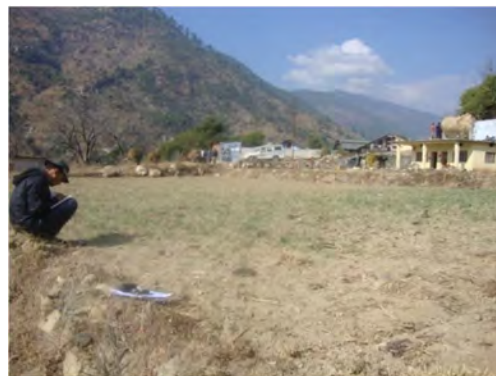
A side view of the proposed site from SE direction.