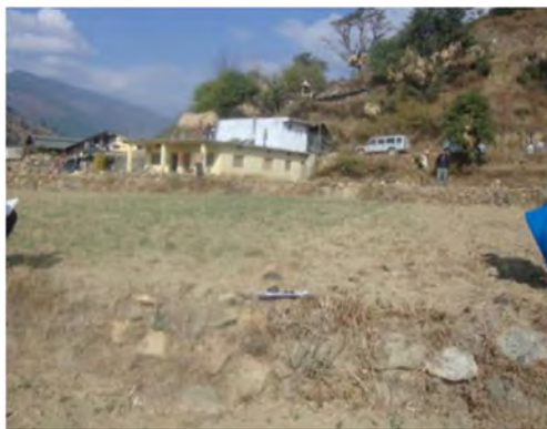
A front view of the proposed site from South direction.

The proposed area is on a flat alluvial deposit man made terrace. The slope of the uphill of the site is 55^{\circ} - 60^{\circ} towards South direction. The Nagangaon-Masalgaon motor road and some houses in the NW direction have been constructed within the past 5 years. The soil is alluvial type, brown color, silty clay material of 3-4m thickness. The proposed site depending on the geotechnical observations is stable for the construction of the house.