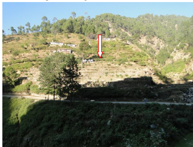
A view of propose site and slope of the site from left bank of the Udri gad

General slope of the proposed site is 20°-25°, hill side slope from proposed site trending 25°-30°, downhill slope trending 20°-25°S 10°W direction.