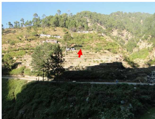
A view of propose site and slope of the site from left bank of the Udri gad

General slope of the proposed site is 20°-25°, hill side slope from proposed site trending 25°-30°, downhill slope trending 20°-25° towards S 10°W direction.