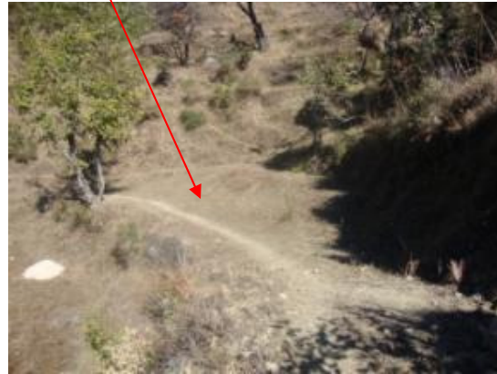
A view from SW direction of the proposed site.

The proposed site is situated on a hill slope terrace in Village Mason. The overburden thickness in the proposed site is 8-10m approximately. There are fragments of phyllite and