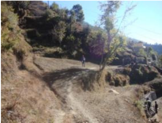
A far view from North direction of the proposed site.