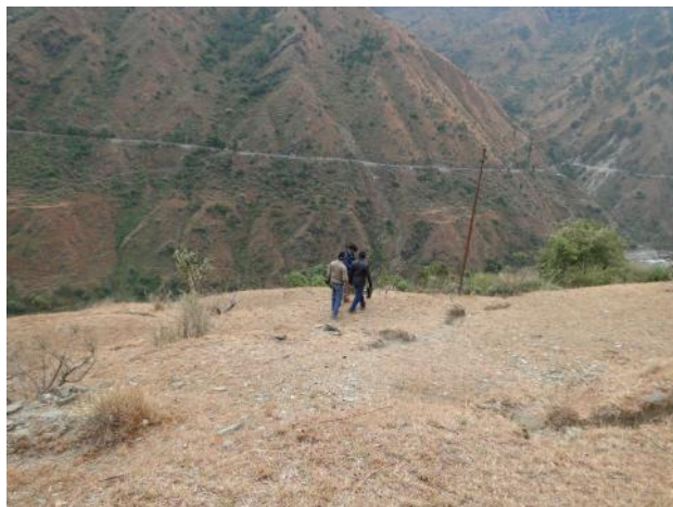
Close view of the proposed site

The site is located on colluvial deposit and man-made cultivated step terraces with low vegetation are present. The thickness of overburden is varying at places in between 2-5m approx with boulders embedded in the soil at the proposed site. The general slope is 20 0 -25 0 and valley side slope 30 0 -35 0 and hill side slope in E direction. The bed rock have been found along the road cutting, the orientation of the bed is as- Dip amount 45 0 dipping in N 30 0 E direction. The rocks are jointed and weathered and orientation of the joints is as- J1 –Dip amount 70 0 dipping in N 40 0 W, J2 dip amount 55 0 dipping in S 40 0 W direction. The dip of the bed is upstream direction.