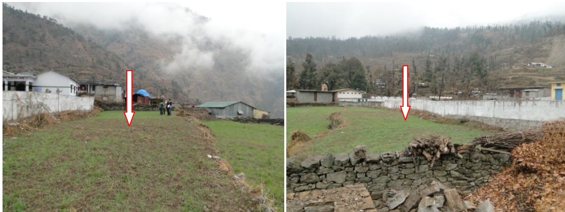
The close view of the proposed site

The proposed site situated on coluvial terrace and manmade flat cultivated land. At 500m horizontal distance in the south-east direction on the right bank of Swari Gad.In coluvial terrace about 1.5-2m thickness of overburden, in overburden Gneiss and quartzite fragments varying size from 1-5cmwith fine grain brownish soil matrix. The proposed site is cultivated and low vegetated. General slope of the proposed site is 10 o -15 o , uphill slope from proposed site is trending20 o -25 o and downhill slope is trending25 o -30 o towards east direction. In toe of the Barshu village towards Swari gad side is continue erosion on rainy session that is landslide formed in the right bank of the river. Due to landslide in river bank that cause is subsidence seen around proposed site. But the proposed site is 100-120m distance from subsidence zone and toe of the hill. Presently the site is suitable for house construction.