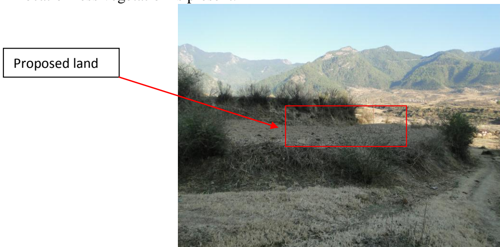
Close view of the proposed site

The site is located on colluvial deposit and man-made cultivated step terraces with less vegetation are present. The thickness of overburden is varying at places in between 2-5m approx with boulders embedded in the soil at the proposed site. The boulders of Quartzite and gneiss, general slope are 10 o -15 o and 20 o -25 o hill side in S direction. At around the site location less vegetation is present.