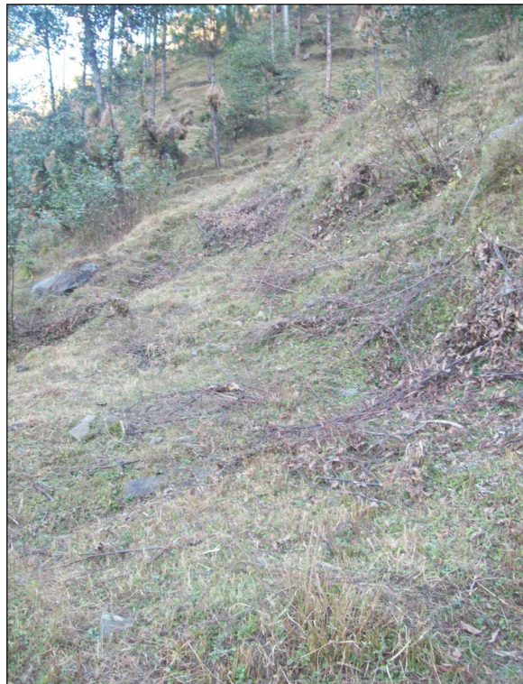
Side view of the proposed site for construction

At the site thick alluvial soil cover and quartzite rock fragments of size 3-4cm in the soil matrix are found. At the proposed site the soil is consolidated, the rate of infiltration is high making the soil water saturation high as the area receive high rainfall.