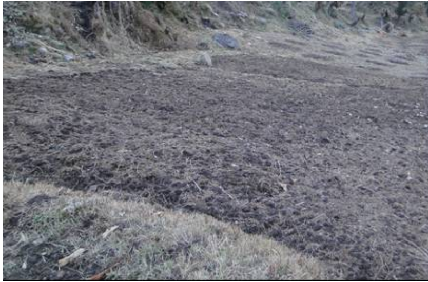
Close view of the proposed site

The site is located on colluvial deposit and man-made cultivated step terraces with moderate vegetation are present. The thickness of overburden is varying at places in between 2-5m approx with boulders embedded in the soil at the proposed site. The boulders of Quartzite and gneiss, general slope are 20° -25° and 25°-30° hill side, downhill slope is 30° -35° in S direction. At around the site location moderate vegetation and population is present.