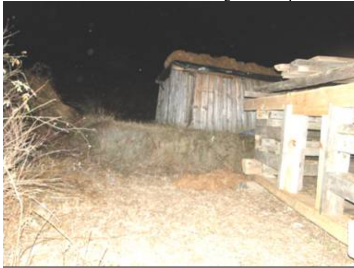
Close view of the proposed site

The site is located on colluvial deposit and man-made cultivated step terraces with moderate vegetation are present. The thickness of overburden is varying at places in between 2-5m approx with boulders embedded in the soil at the proposed site. The boulders of Quartzite and gneiss, general slope are 10 o -15 o and 15 o -20 o hill side, downhill slope is 20 o - 25 o in S direction. At around the site location moderate vegetation is present.