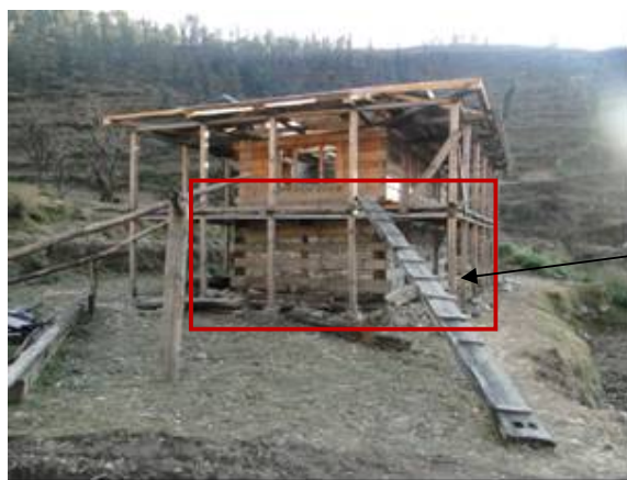
Close view of the proposed site

The proposed site is on colluvial overburden material varying in thickness range from >3m approx at places, man-made cultivated terraces are present. The uphill slope is 20°-25° and the downhill slope is 15°-20° sloping in north-west direction. Around the proposed site location dense mix vegetation of Banjh, is present at about 150m-200m approx in uphill side. A seasonal flow is passing from S side of land at about 100m approx flowing in NW direction.