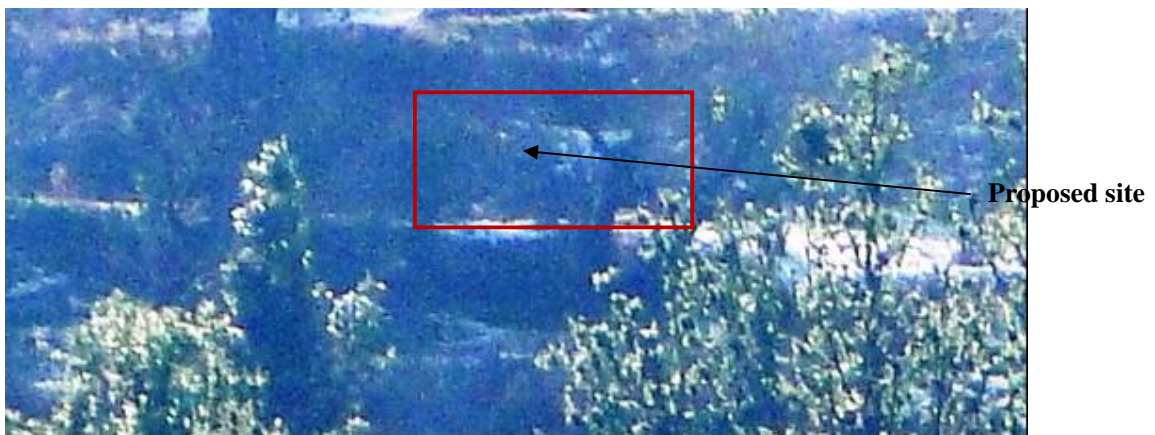
Close view of the proposed site

The proposed site is on colluvial overburden material varying in thickness range from >5m approx at places, man-made cultivated terraces are present. The uphill slope is 20°-25° and the downhill slope is 25°-30° sloping in north direction. Around the proposed site location dense mix vegetation of Banjh, Chulu, etc., is present at about 30m-40m approx in uphill side. A perennial nala flow is passing from N side of land at about 100m-150m approx flowing in NW direction.