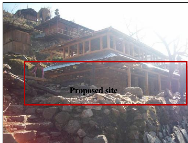
Close view of the proposed site

The proposed site is on colluvial overburden material varying in thickness range from 1-2m approx at places, man-made cultivated terraces are present, is old rock fall. The uphill slope is 40°-45° and the downhill slope is 30°-35° sloping in SW direction. Around the proposed site location least mix vegetation of Banjh, Chulu, etc., is present at about 40-45m approx in uphill side.