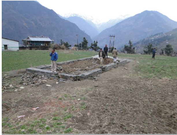
Close view of the proposed site

The site is located on colluvial deposit and man-made cultivated step terraces with moderate vegetation are present. The thickness of overburden is varying at places in between 15-30cm approx with boulders embedded in the soil at the proposed site. The boulders of gneiss and phyllite, general slope are 5° -10° and 10° -15° hill side, downhill slope is 10° -15° in E direction and sirola khadd is present at 2.5km in SE direction. At around the site location moderate vegetation is present.