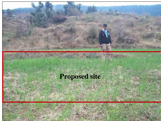
Close view of the proposed site

The proposed site is on colluvial overburden material varying in thickness range from >3m approx at places, man-made cultivated terraces are present. The uphill slope is 20 o -25 o and the downhill slope is 15 o -20 o sloping in west direction. Around the proposed site location least mix vegetation of Banjh, Chulu, etc., is present at about 70m-75m approx in uphill side. A seasonal flow is passing from NE side at about 40m-45m approx flowing in NW direction.