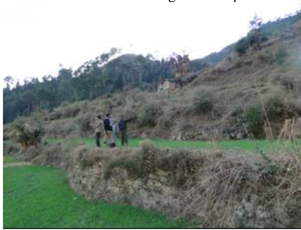
Close view of the proposed site

The site is located on colluvial deposit and man-made cultivated step terraces with moderate vegetation are present. The thickness of overburden is varying at places in between 1-2m approx with boulders embedded in the soil at the proposed site. The boulders of chloritic phyllite, general slope are 15°-20° and 35°-40° hill side, downhill slope is 20°-25° in SE direction. At around the site location moderate vegetation is present.