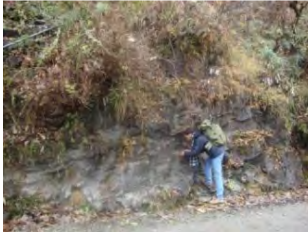
Quartzite outcrop along the NH-123 road in Ranagaon.

The proposed site is on a hill slope in the centre of the Village Rana. The remains of the previously damaged house are present on the site which must be removed before starting of the new construction. The soil is brown color, silty and rich in humus material. The proposed site depending on the geotechnical observations is stable for the construction of the house.