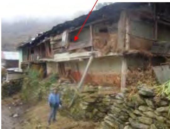
A front view from NW direction of the proposed site.