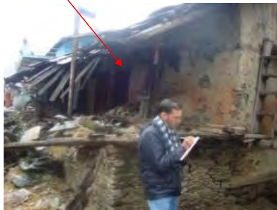
A side view from SW direction of the proposed site.